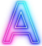
Slim Channel Letters