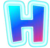
Detail Illumination Work